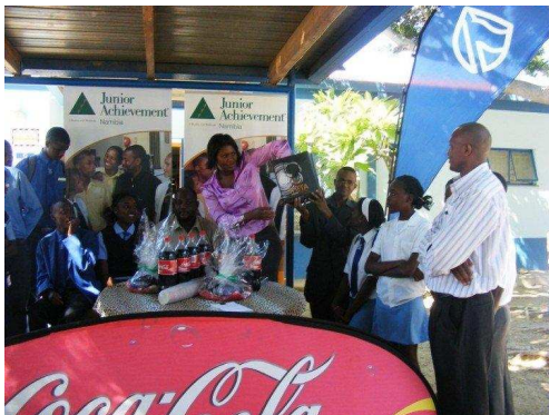
Inspire Entrepreneurship Draw August 2009